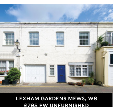
£795 PW UNFURNISHED