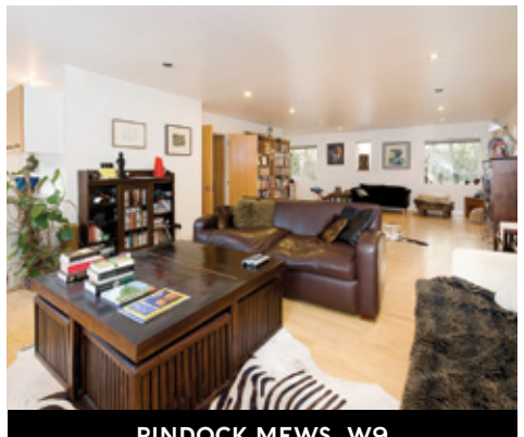
PINDOCK MEWS, W9 £1,500,000 FREEHOLD