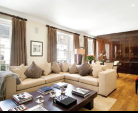
EATON MEWS NORTH, SWI £5,300,000 FREEHOLD