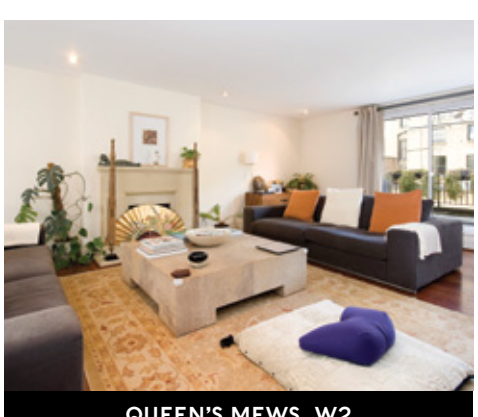
QUEEN'S MEWS, W2 £1,000 PW UNFURNISHED