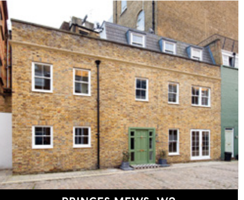
PRINCES MEWS, W2 £1,100,000 FREEHOLD