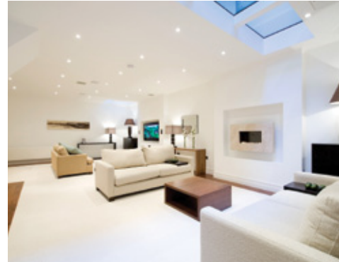
PETERSHAM MEWS, SW7 £3,500,000 FREEHOLD