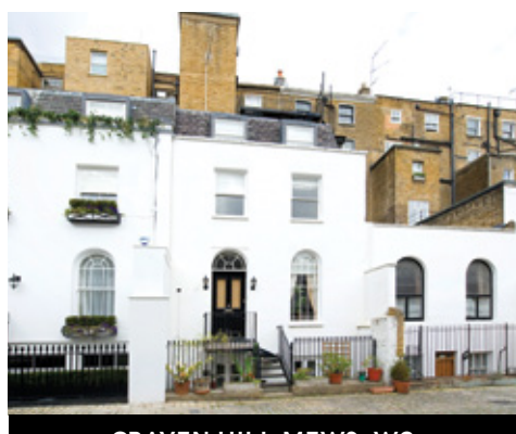
CRAVEN HILL MEWS, W2 £895 PW UN/FURNISHED