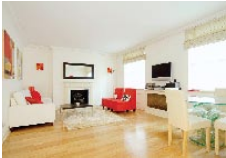
Brook's Mews, W1 £900 pw Furnished