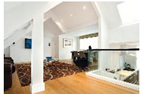
Bourdon Street, W1 £2,200 pw Fully Furnished