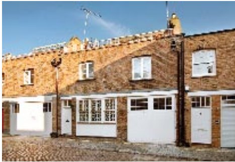
Connaught Close, W2 £700 pw Unfurnished/Furnished