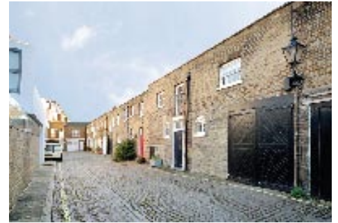
Abercorn Close, NW8 £950 pw Furnished