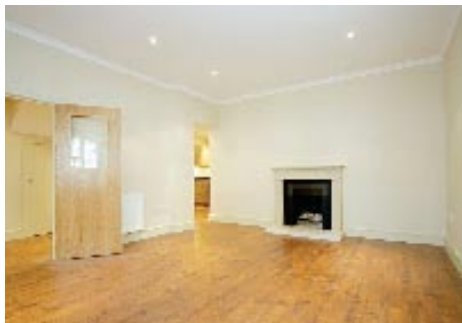
Clabon Mews, SW1 £1,600 pw Unfurnished