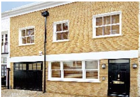
Cornwall Mews South, SW7 £1,200 pw Unfurnished