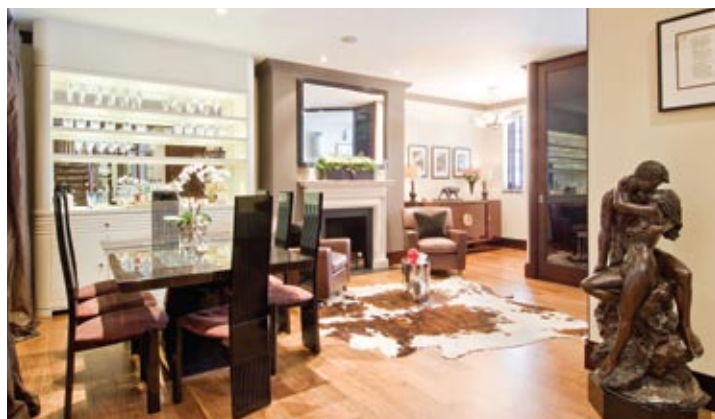
EATON MEWS NORTH, SW1 | £5,500,000 FREEHOLD