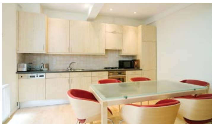
BATHURST MEWS, W2 | £895,000 LEASEHOLD