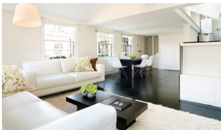
LEDBURY MEWS NORTH, W11 | £825 PW FURNISHED