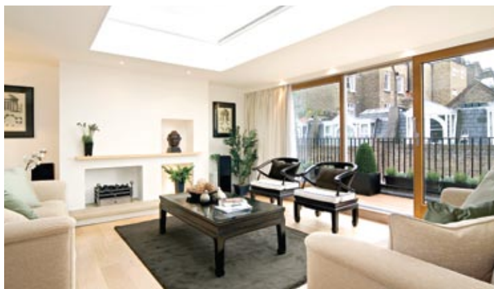
REECE MEWS, SW7 | £1,495 PW UN/FURNISHED

to arrive before the 1st September 2009; with name of the mews, child's Christian name, parents' telephone or email on the back. Sorry, but originals will not be automatically returned.