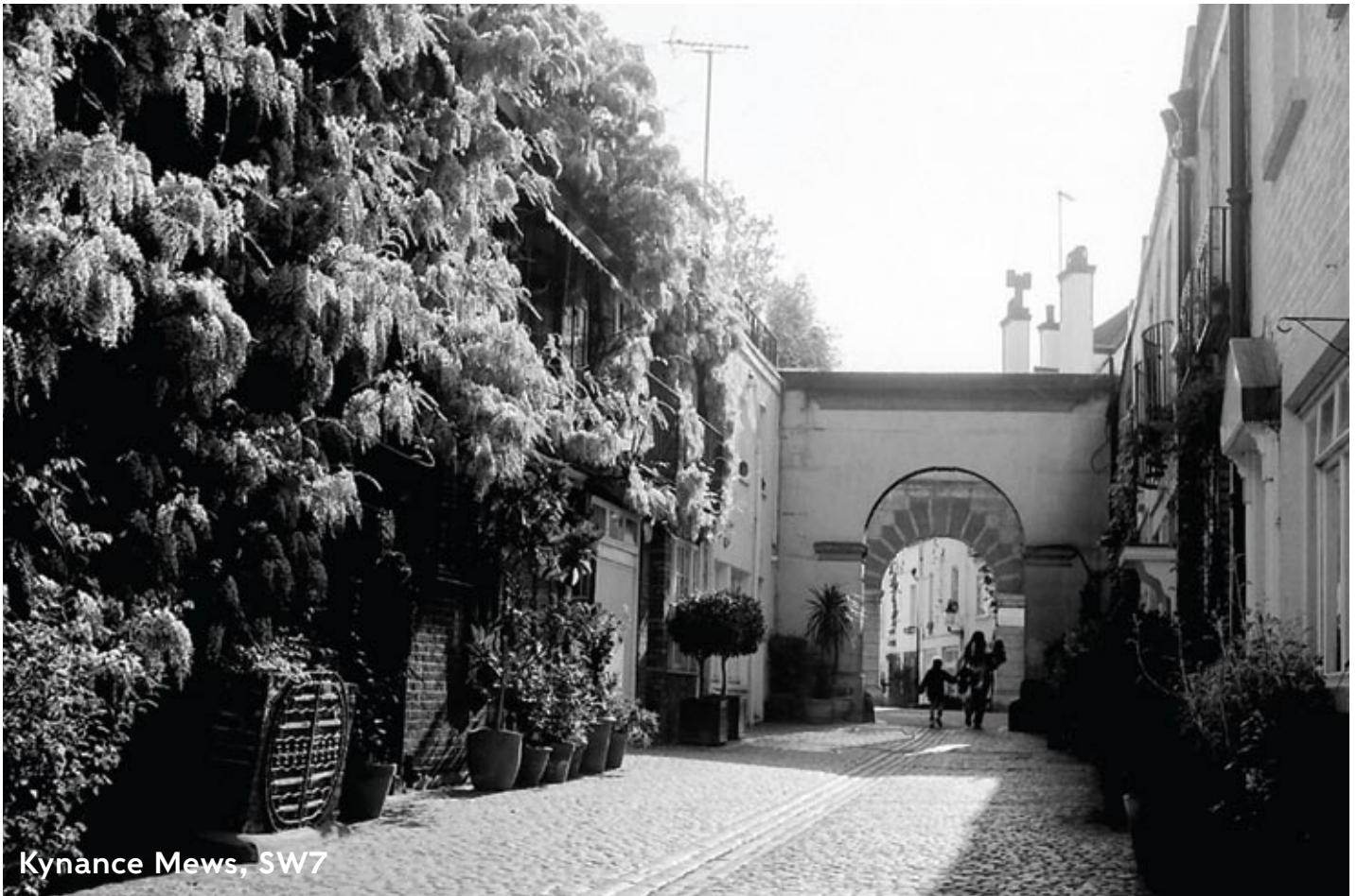
Kynance Mews, SW7