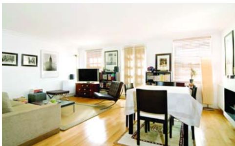
Montagu Mews West W1 £575 pw Unfurnished