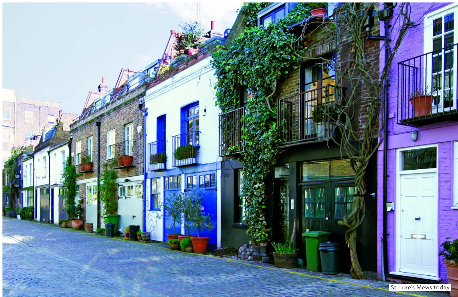
St Luke's Mews today