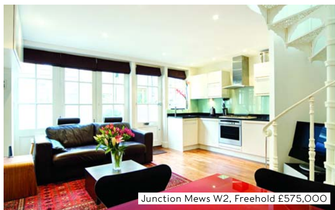
Junction Mews W2, Freehold £575,000

Finally, this is the second turnaround by the Government. The Home Information Pack is now so diluted that it really is a worthless exercise.