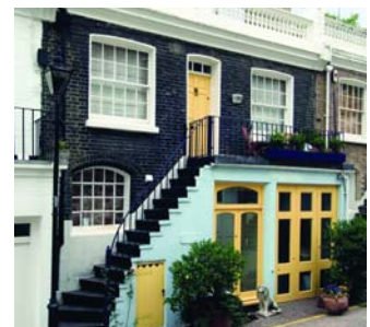
Holland Park Mews W11 £1,150 pw Unfurnished