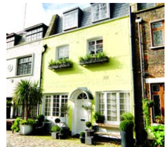
Albion Mews W2 £775 pw Unfurnished