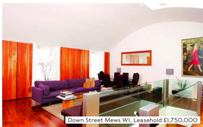
Down Street Mews W1, Leasehold £1,750,000