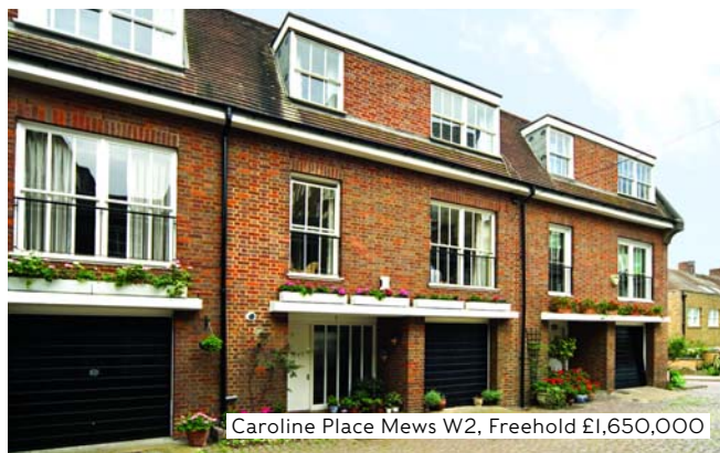
Caroline Place Mews W2, Freehold £1,650,000