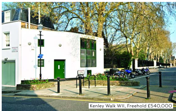
Kenley Walk W11, Freehold £540,000