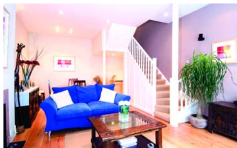
Princes Gate Mews SW7 £1,400 pw Un/Furnished