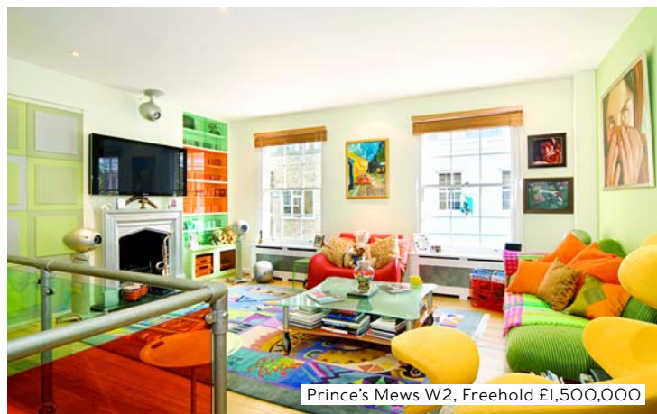
Prince's Mews W2, Freehold £1,500,000

Chapman's story is told in “Agent Zigzag” by Ben Macintyre (published by Bloomsbury Publishing). It is a gripping story, and a recommended read.