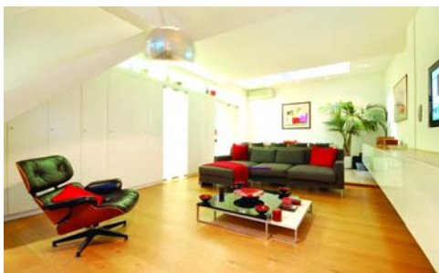
Hyde Park Garden Mews W2 £1,100 pw Unfurnished