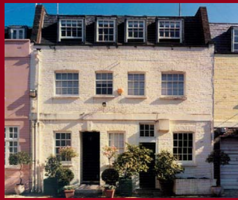
CLARENDON CLOSE W2

You believe the canard that mews are small and dark? Try this one. 3,500 sq ft with a 46' garden and a lock-up garage.