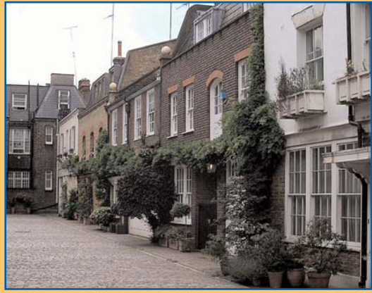
Devonshire Close was called Devonshire Mews East from 1899 to 1934 and before that the rather romantic sounding, Cape of Good Hope Mews.

Mews in Bloom is judged on the extent to which residents have enhanced the