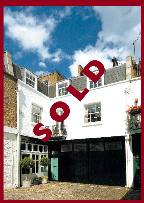
QUEEN'S GATE PLACE MEWS SW7 £1.695 million Subject to Contract

£2.95 million Subject to Contract 020 7479 1999