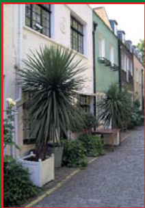
Albion Mews W2