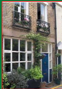
Kynance Mews SW7