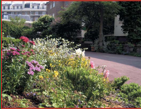
Winner - Sussex Mews East W2