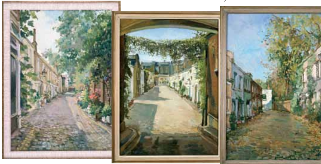
Top row, left to right: Minera Mews; Kynance Mews; Lennox Gardens Mews; Cornwall Gardens Walk Bottom row, left to right: Kynance Mews; Bathurst Mews; Albion Mews; Hyde Park Gardens Mews

IN 1949 , she exhibited for a second time at the Salon, where she was again awarded, this time with the Prix de la Savoie, by the Ministère de la