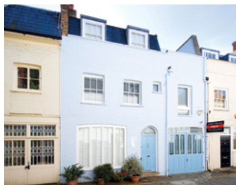
KYNANCE MEWS, SW7 £1,150 PW UNFURNISHED