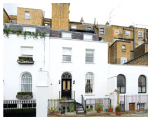
CRAVEN HILL MEWS, W2 £1,100 PW UN/FURNISHED