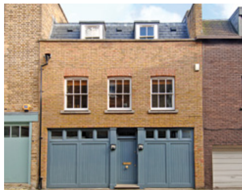
SHERLOCK MEWS, W1 £1,350,000 FREEHOLD