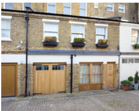
LANCASTER MEWS, W2 £895 PW UN/FURNISHED