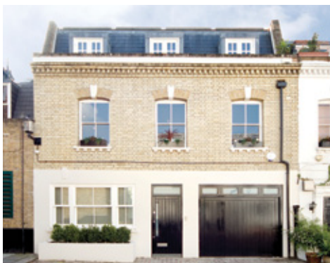
SPEAR MEWS, SW5 £1,795,000 FREEHOLD