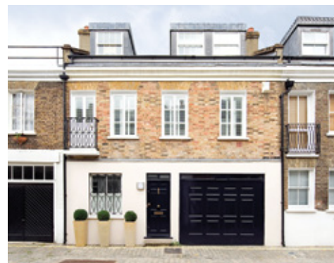
PINDOCK MEWS, W9 £1,995,000 FREEHOLD